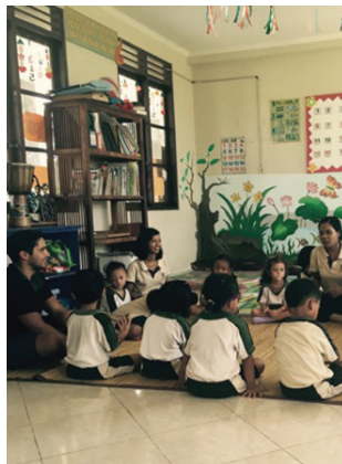
BALI HATI SCHOOL - NOT-FOR-PROFIT SCHOOL AND SHELTER IN UBUD

This was a wonderful opportunity for our students to meet child and youth care workers, social workers, therapists, foster carers, and a wealth of other professionals involved with children, youth and families from around the world who shared their knowledge and ideas.