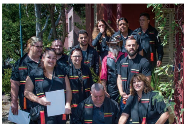
STUDENTS FROM THE 91541NSW Diploma of Applied Aboriginal Studies course