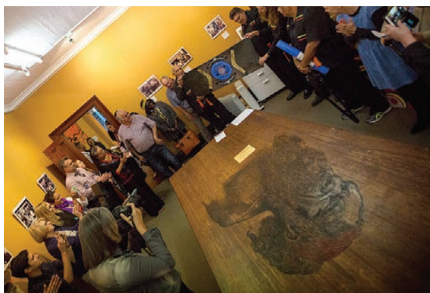
GWOYA JUNGARAI WOOD BURNING BY PIRATE (REPRODUCED WITH PERMISSION OF THE AINSLIE ROBERTS FOUNDATION)