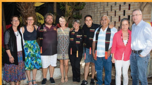
GRADUATING STUDENTS WITH THEIR JAWUN MENTORS WHO OFFER THEIR TIME AND SUPPORT THROUGHOUT THE LEGAL ADVOCACY COURSE