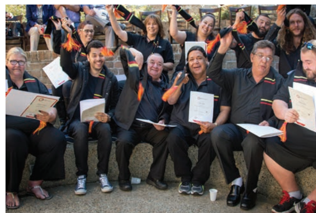
2016 GRADUATION DAY AT TRANBY

Tranby congratulates our 42 talented and hardworking students who graduated with a Diploma or Certificate in the courses listed above. A further 56 students achieved a Statement of Attainment for partial completion of these courses in 2016.