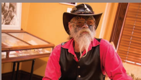
MYANGAH (SEA EAGLE) PIRATE